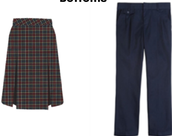
Plaid Skirt/ Navy Blue Khaki Bottoms